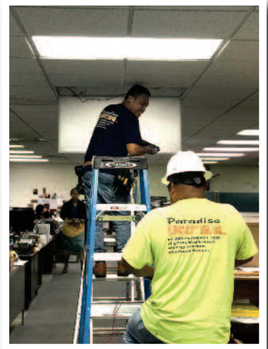
Workers install new lighting at the King St. branch.

Come down to King Street and see our branch in a whole new light!