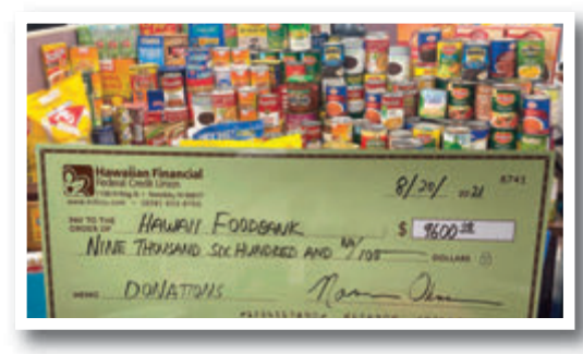
The donations poured in at all of our branches!

Thank you to all our members for their generous donations, and showing us your true aloha spirit.