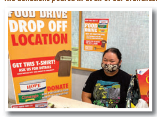
HIFICU staff helps collect donations in our main branch lobby.