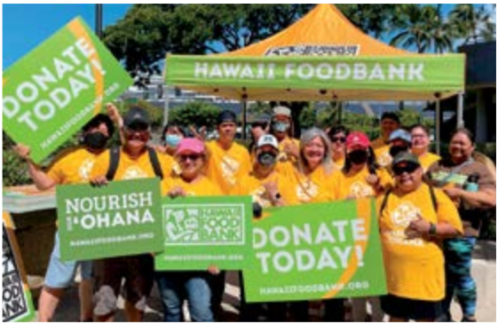
HIFICU volunteers at the Food Collection Day Event

Throughout August and September, HIFICU lent a helping hand to Hawaii Food Bank by having our branches serve as donation collection centers for their annual food drive. It was another successful campaign. As usual, our members stepped up admirably once again to bring in a great amount of canned goods and monetary donations. In October, all donations were dropped off to the Hawaii Food Bank. A very special MAHALO to all our members who came in to make generous cash donations and canned good contributions.