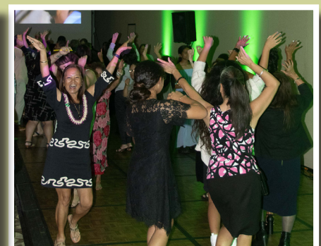
The packed dance floor