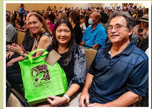
Lucky door prize winners