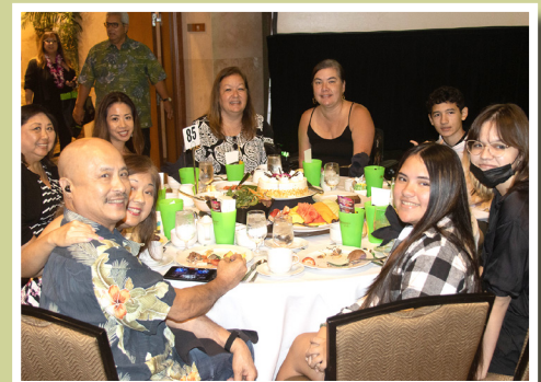
Members enjoying the Hawaiian food